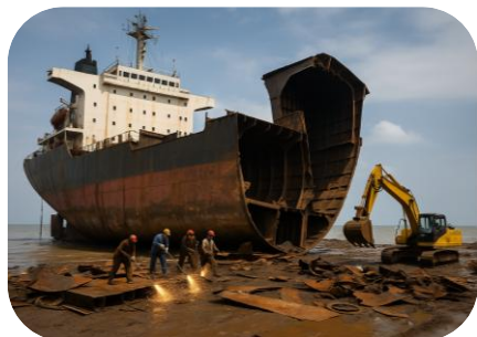
SHIP RECYCLING (INDIA)

Under Ship Building Financial Assistance Scheme (SBFAS 2.0)