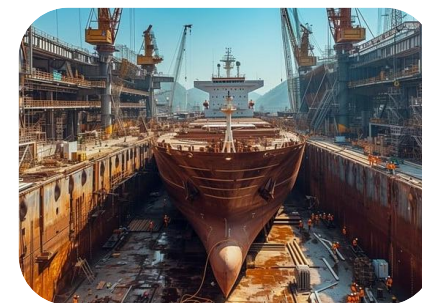
NEW SHIPBUILDING (INDIA)

Validity: 3 Years from date of completion of recycling