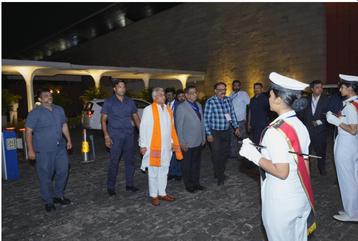
Fig. 11 - Arrival and ceremonial reception of the Chief Guest and dignitaries.