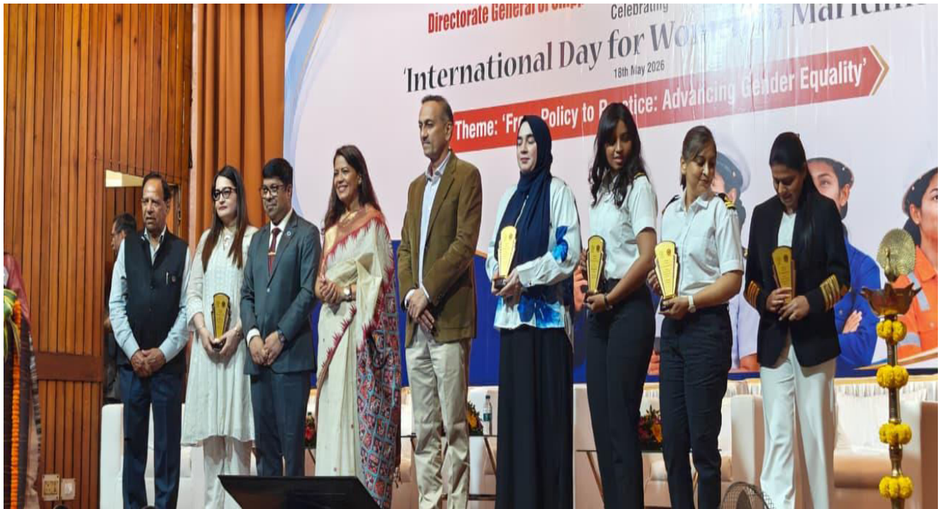
Fig. 3 — Women Panelists with the Additional Director General of Shipping, IPS, and Distinguished Guests at the event

ashore. The session encouraged candid dialogue on the structural barriers that continue to affect women's participation and highlighted the importance of supportive policies, strong grievance redressal systems and sector-wide commitment. Thereafter, industry representatives from Maersk Fleet Management and Technology India and Training Ship Rahaman made presentations on best practices and gender equality initiatives implemented in their respective organisations, offering practical insights that may be replicated across the maritime ecosystem.