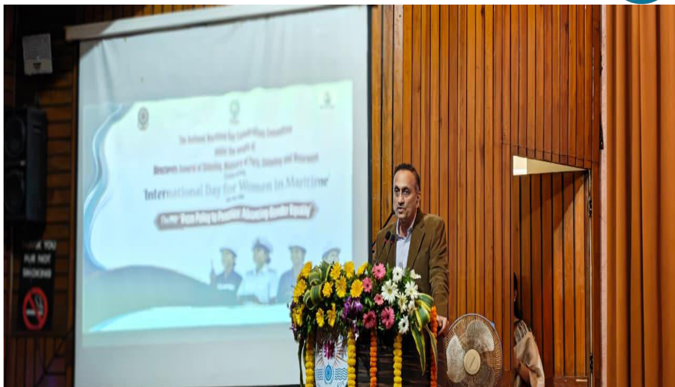
Fig. 2 — Address at the podium during the International Day for Women in Maritime 2026