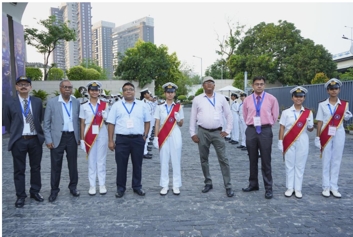
Fig. 10 - Guard of Honour and ceremonial welcome arrangements at ITC Sonar, Kolkata.