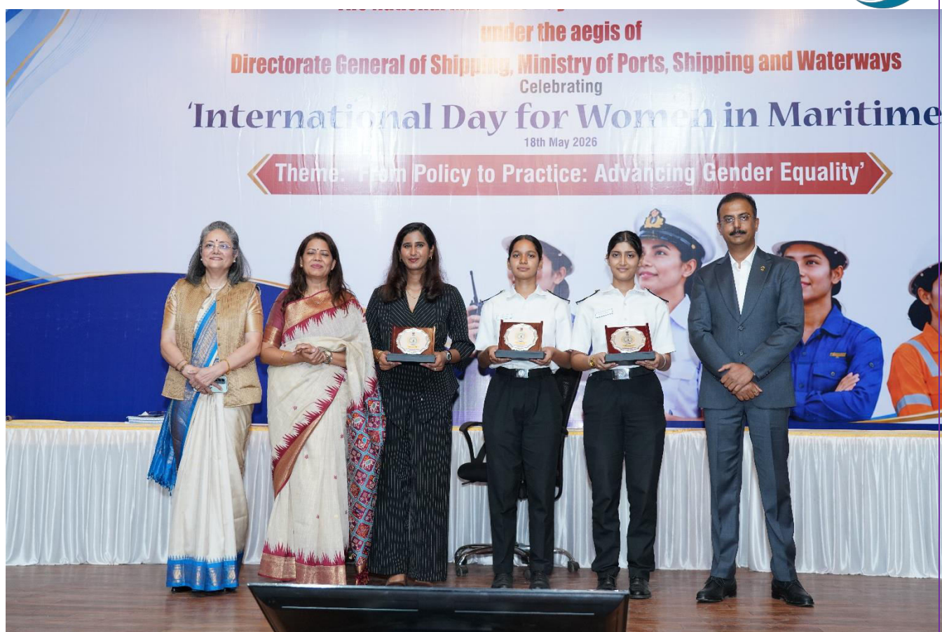
Fig. 5 — Women Seafarers being honoured for sharing their inspiring success stories under the Sagar Mein Samman initiative