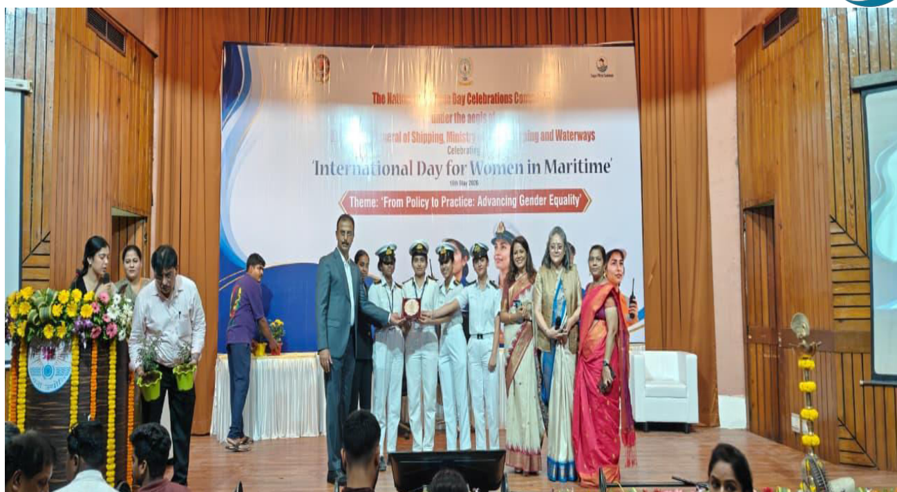
Fig. 7 — Felicitations of Women Excelling in Academic Performance in the Maritime Sector (II)