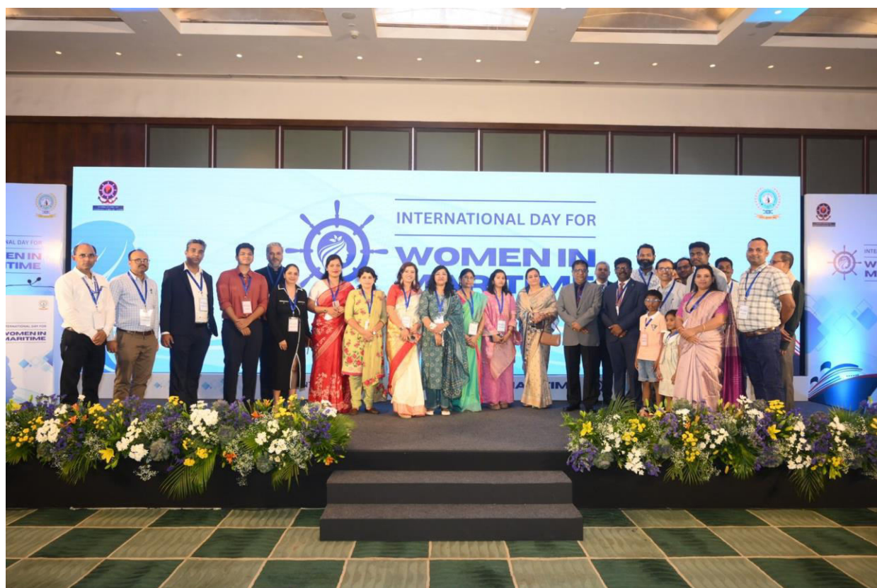
Fig. 16 - Group photograph of dignitaries, officials, participants and stakeholders at the Kolkata celebration.