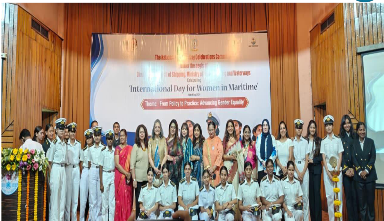
Fig. 9 — Sagar Mein Samman Committee Members and Cadets at the International Day for Women in Maritime 2026