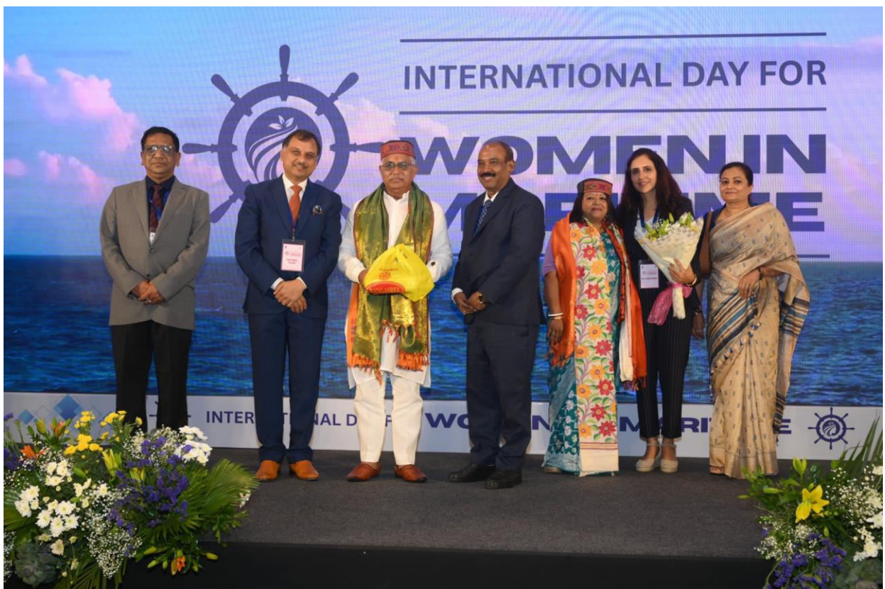
Fig. 14 - Felicitation of distinguished women contributors from the maritime sector.