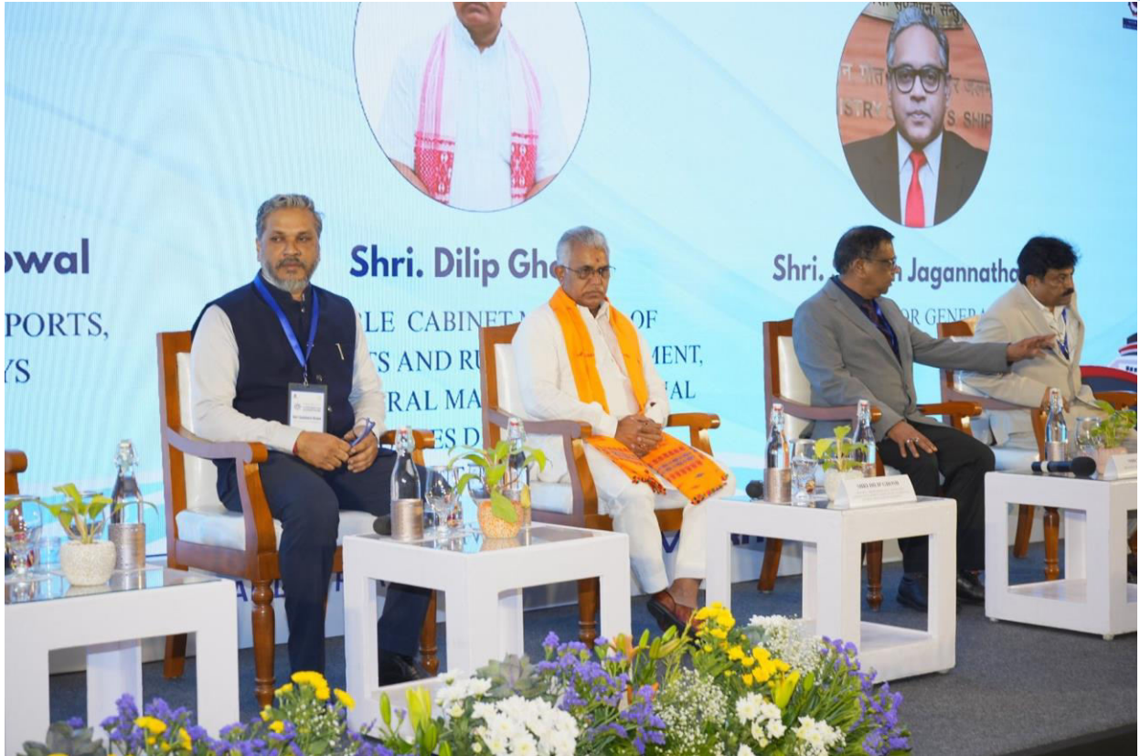
Fig. 13 - Unveiling of the Five-Year National Action Framework for Women in Maritime.