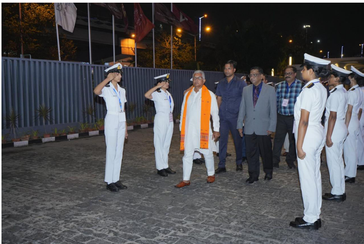
Fig. 12 - Lighting of the ceremonial lamp during the Kolkata celebration.