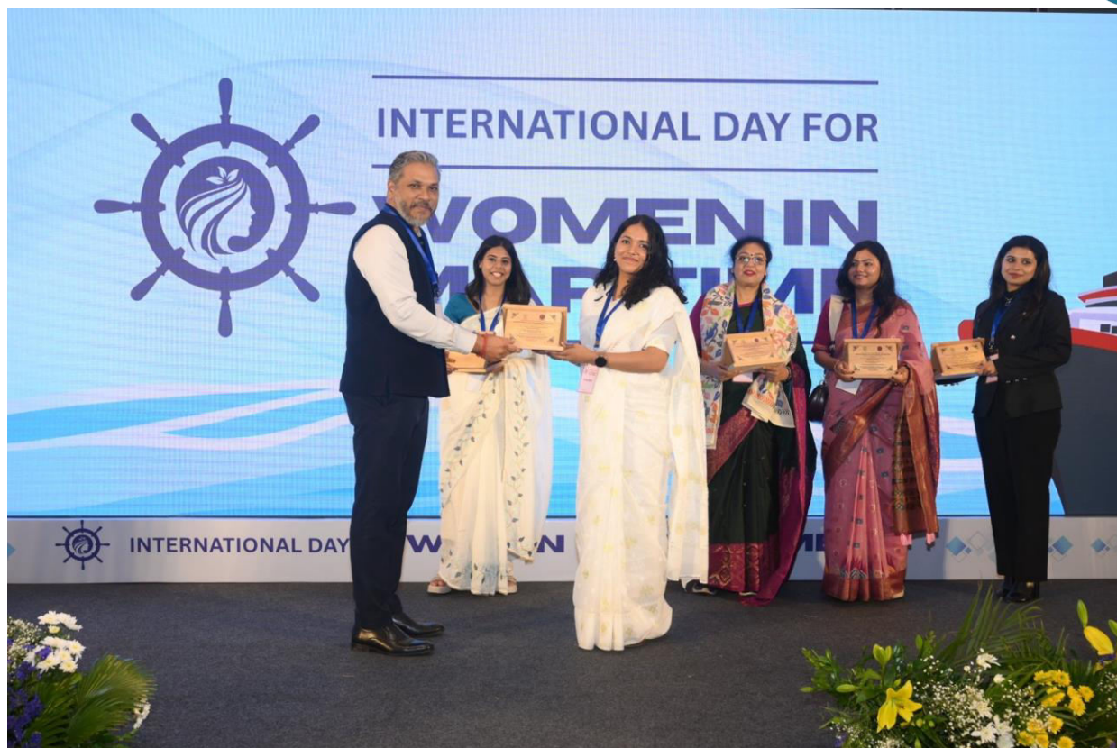
Fig. 15 - Presentation and recognition segment during the Kolkata programme.