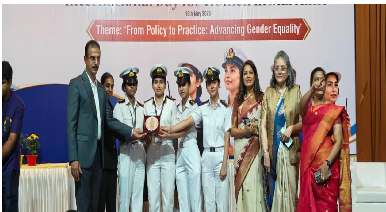
Fig. 6 — Felicitation of Women Excelling in Academic Performance in the Maritime Sector (I)

The felicitation was conducted in a dignified and celebratory manner, with each awardee receiving recognition for her specific area of distinction. The moment was particularly significant for the younger cadets in the audience, for whom these achievers served as visible, tangible proof that excellence in maritime education has no gender.